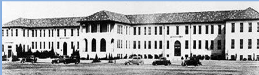
Austin Hall, Air Corps Tactical School, 1931, now Headquarters Air University

The late 1920s began Maxwell's "Golden Age." In 1928, the War Department announced the relocation of the Air Corps Tactical School (ACTS) from Langley Field, Virginia, to Maxwell Field with the assistance of Alabama US Congressman Joseph Lister Hill, who had successfully removed Maxwell Field from the War Department's installation closure list in 1925. As a result, the number of personnel at the field grew from only 210 in the spring of 1931 to nearly 2,000 by September when the ACTS officially opened at Maxwell with 41 students.