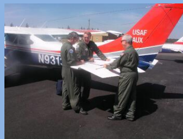
Planning a CAP Mission

During the 1970s, AU continued to grow. The Air Force established the Air Force Logistics Management Center (AFLMC) and assigned it to Air University on 1 October 1975. On that same day, the Leadership and Management Development Center (LMDC), HQ Civil Air Patrol-USAF (HQ CAP-USAF), and the Air Force Judge Advocate General School joined the AU family. The following year, LMDC was merged with the AU Institute for Professional Development but retained its name. on 1 June 20016, the Air Force transferred HQ CAP-USAF to First Air Force, Air Combat Command, Tyndall AFB, Florida.