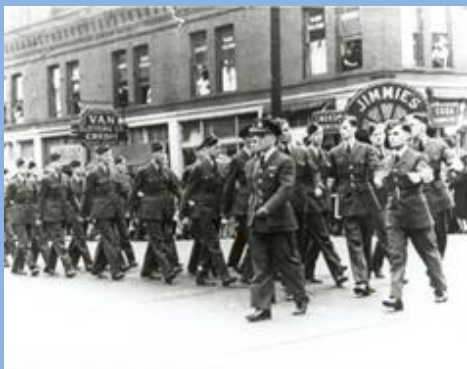
RAF cadets from Maxwell in Armistice Day parade, Montgomery AL, Nov 1941

In 1941, the War Department expanded Maxwell's flying training mission. The Air Corps established an advanced flying school at Maxwell and a basic school at Montgomery's Municipal Airport, which became Gunter Field to honor the recently deceased mayor of Montgomery, William A. Gunter. By the end of the war, these schools in the Southeast United States graduated more than 100,000 aviation cadets, including the three flight schools at Tuskegee, Alabama, which trained the over 900 African American pilots, known as the Tuskegee Airmen.