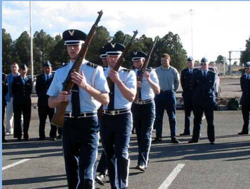
Air Force ROTC Unit Practicing Drills

The outbreak of the Korean War on 25 June 1950 interrupted AU's growth and stability. Air Force commanders argued they needed the personnel attending AU for operational commitments and that the Air Force should close AU. However, Air Force leaders, rather than closing AU completely, reduced its operations, suspended the AWC and the Air Tactical School, and reduced the length of the ACSS to less than four months.