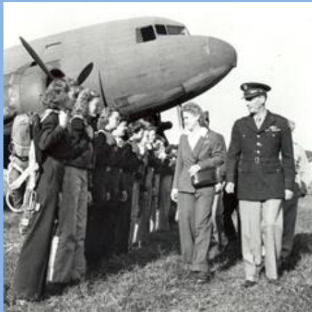
Jacqueline Cochran, Chief of the WASP, inspects women pilots at Maxwell

Maxwell Field, like other AAF installations, had its own segregated African American unit, the 4th Aviation Squadron, established on 10 June 1941. Located near the Alabama River on the north edge of Maxwell Field, the present site of the federal prison camp, this segregated squadron had its own facilities. Although its official mission was stated as “security,” the squadron’s primary duties consisted of service as buglers, custodians, chauffeurs, drummers, foot messengers, hospital and mess hall attendants, military police, and truck drivers. Nearby Gunter Field had the 22d Aviation Squadron for the same general duties.