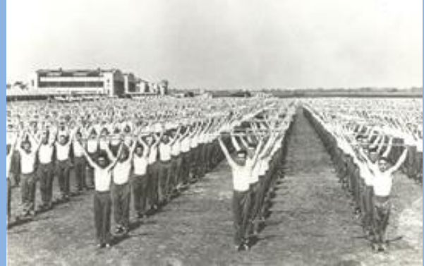
Physical fitness exercises for flight cadets at Maxwell Field during World War II

On 6 September 1941, the Air Corps Replacement Center opened at the field. The center provided candidates for pilot, bombardier, and navigator training with classification and preflight instruction. In mid-1942, the center became the preflight school for pilots and later expanded to include preflight training for bombardier and navigator trainees.