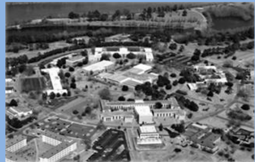
Chennault Circle in the 1970s with Air University Library in the Center

In 1954, AU upgraded the ACSS to the Air Command and Staff College (ACSC), and the Air Tactical School became the Squadron Officer School. Later, the Air Force moved the majority of its professional continuing education courses to Maxwell AFB. Meanwhile, the Gunter AFB branch of the School of Aviation Medicine became a part of AU, and the 3870th Special Activities Group followed, later renamed the Research Studies Institute.