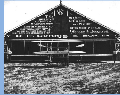
Wright Flying School Hanger and Maintenance Workshop, 1910

The history of Maxwell Air Force Base began with Orville and Wilbur Wright, who, following their 1903 historic flight, decided in early 1910 to open a flying school to teach people how to fly and to promote the sale of their airplane, Wilbur. After looking at locations in Florida, Wilbur came to Montgomery, Alabama in February 1910 and decided to open the nation's first civilian flying school on an old cotton plantation near Montgomery that subsequently become Maxwell Air Force Base (AFB). Unfortunately, the school closed after only ten weeks because of unseasonable high winds.