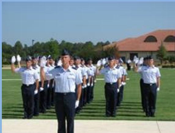
Commissioning Ceremony at Officer Training School

In 2006-2007, AU's structure and program effectiveness underwent an in-depth review that led to major changes in AU's structure. In April-July 2008, the Air Force activated the Carl Spaatz Center for Officer Education with AWC, ACSC, SOC and SAASS as subordinate units. It also redesignated the College of Enlisted Professional Military Education as the Thomas E. Barnes Center for Enlisted Education with the Community College of the Air Force (CCAF), the Air Force Senior Noncommissioned Officer Academy, and the First Sergeants Academy as subordinate units. The Air Force Doctrine Development & Education Center became the Curtis LeMay Center for Doctrine Development & Education, and Air Force Officer Accessions and Training School became the Jeanne M. Holm Center for Officer Accession and Citizen Development. AU also created the Air Force Research Institute to provide independent analysis and scholarship in support of the Air Force's mission and contribution to national security.