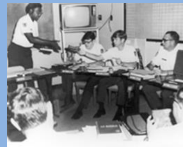
Air Force SNCO Academy Seminar at Gunter Annex

Secretary of the Air Force Donald B. Rice and the Chief of Staff of the Air Force General Merrill A. McPeak created a vision of an Air Force office that would inculcate the principles of total quality management across the Air Force. This concept, later known as the Quality Air Force (QAF), led to the establishment of the Air Force Quality Center on 1 August 1991 under AU at Maxwell. The center provided the Air Force with the concepts, methods, tools, and advice to aid them in attaining a QAF culture, as well as QAF education programs, consulting services, training resource materials, and related research and analysis services.