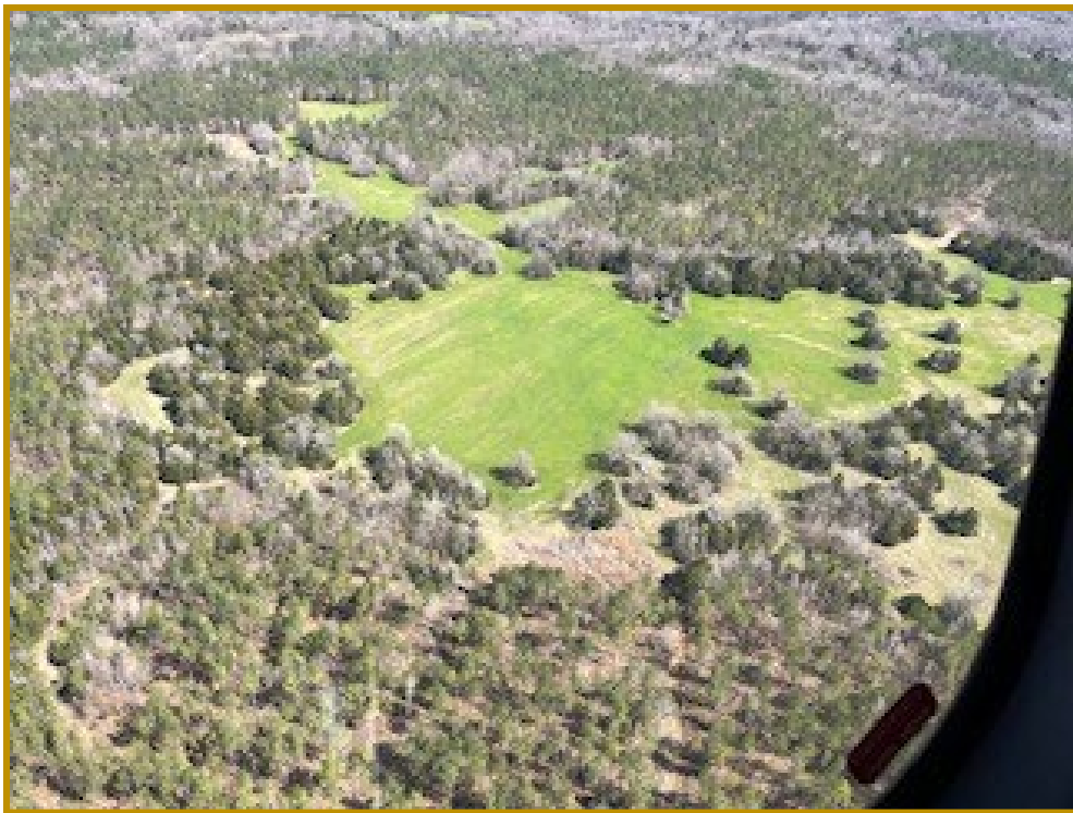
Photograph No.2: Western Aerial View of the COPTER HLZ