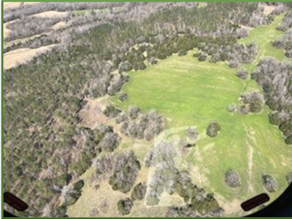
Photograph No. 1: Southern Aerial View of the COPTER HLZ.