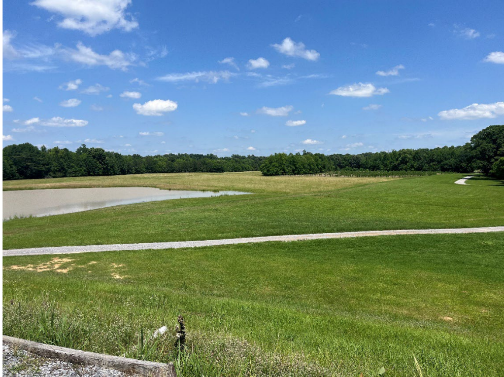
Photograph No. 1: Northeastern View of the FOSHEE HLZ.