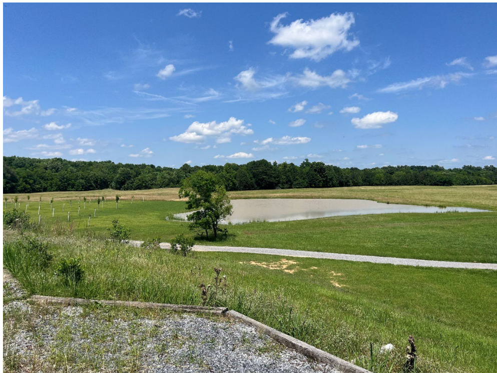
Photograph No.2: Eastern View of the FOSHEE HLZ