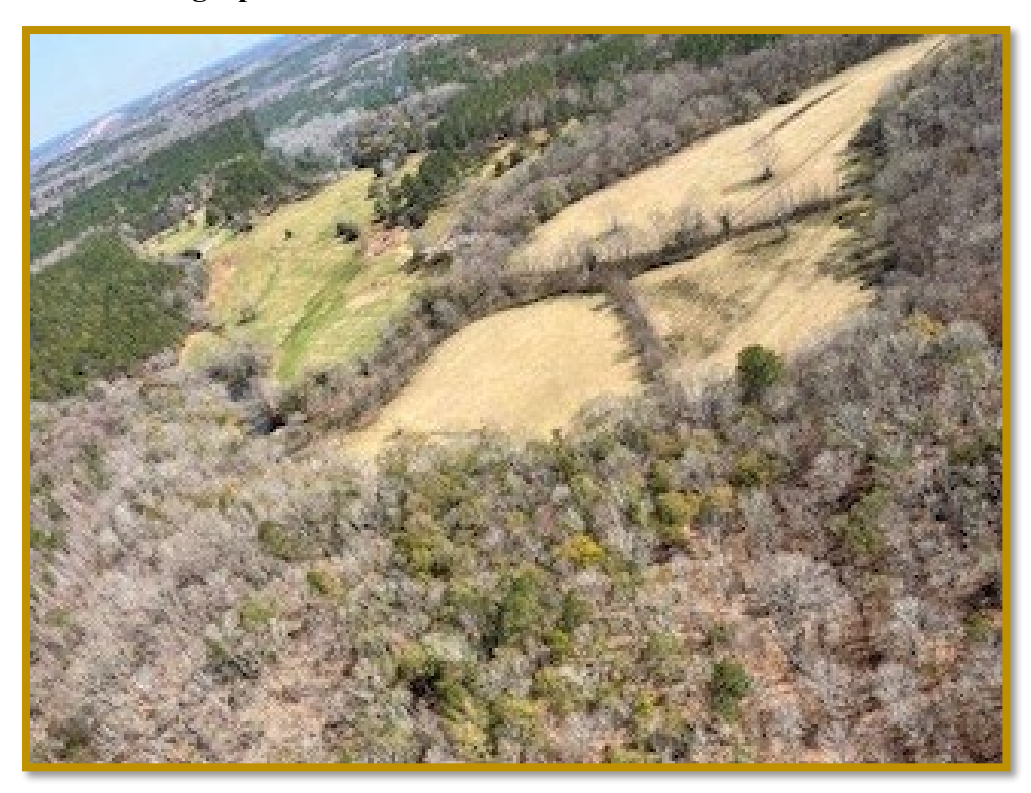
Photograph No.2: Western Aerial View of the BELL HLZ