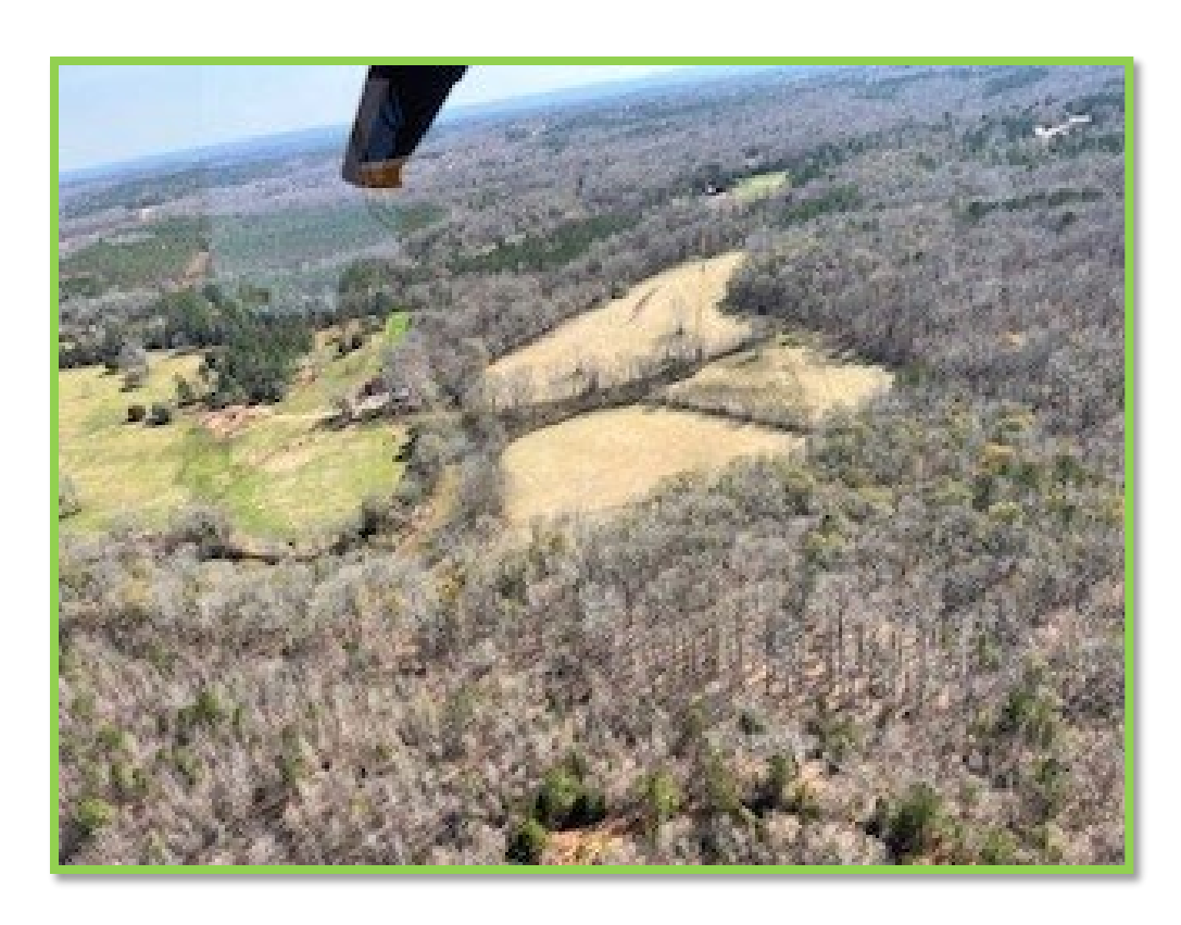
Photograph No. 1: Northern Aerial View of the BELL HLZ.