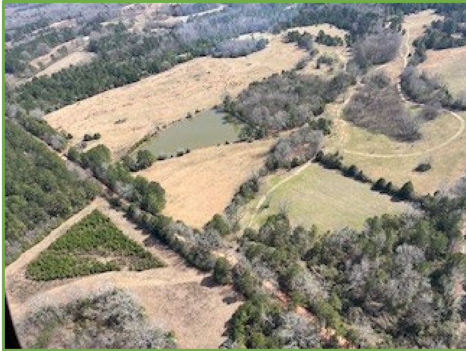
Photograph No. 1: Northeastern Aerial View of the PIG PEN HLZ.