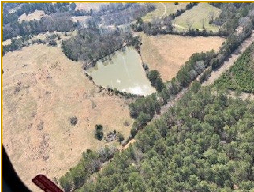
Photograph No.2: Northern Aerial View of the FOSHEE HLZ