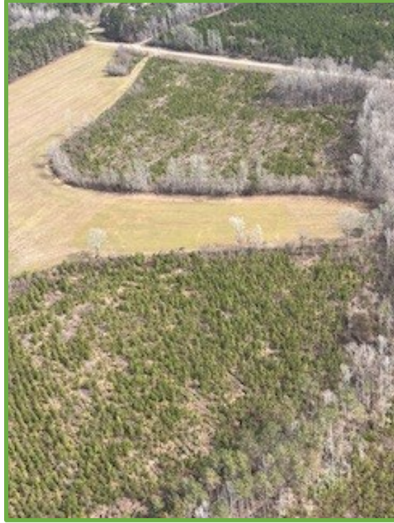
Photograph No. 1: Eastern Aerial View of the PROPS HLZ.