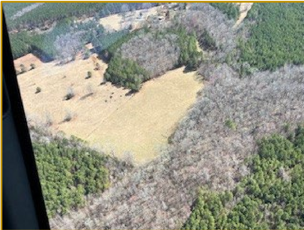
Photograph No.2: Northeastern Aerial View of the SNOOPY HLZ