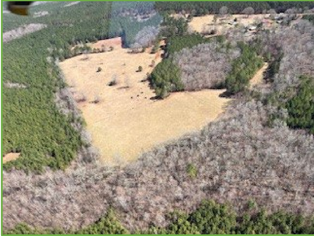
Photograph No. 1: Eastern Aerial View of the SNOOPY HLZ.